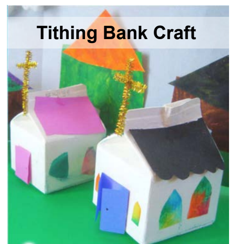
Tithing Bank Craft